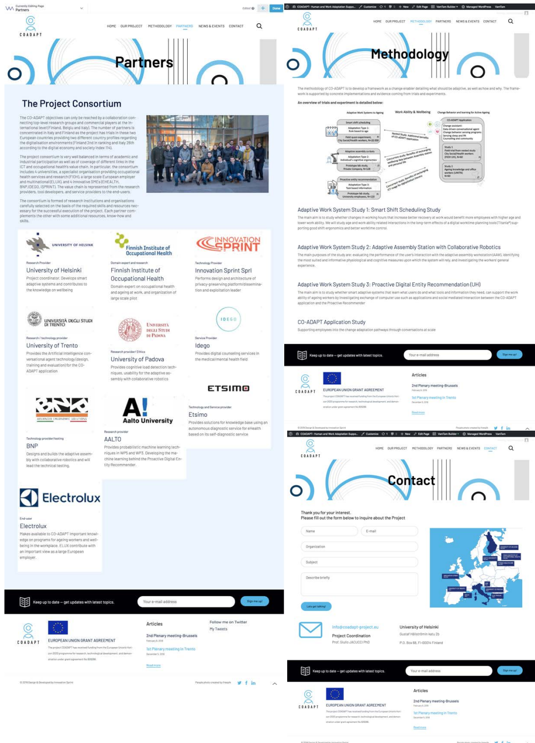
Figure 2 More pages from the Website